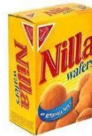
Nabisco Nilla Wafers