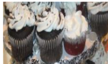
The Pie Place* Cake pops Truffles Mini-cupcakes