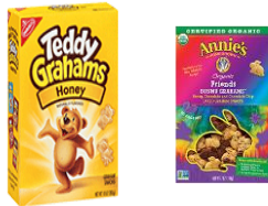
Teddy Grahams Bunny Grahams