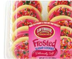
Lofthouse Frosted Sugar Cookies